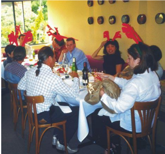
A few of the Sydney and Melbourne staff at the Christmas party following the training day.

from all our offices in Australia and New Zealand.