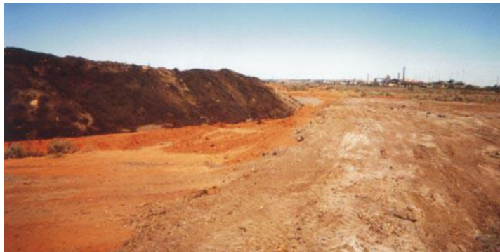
Before it is landfarmed, the more heavily contaminated soil will be composted in conical piles to create more heat and allow water percolation through the pile.

of soil/microbe ameliorants. It is expected that each treatment will take six to nine months. Before it is landfarmed, the more heavily contaminated soil will be composted in conical piles to create more heat and allow water percolation through the pile.