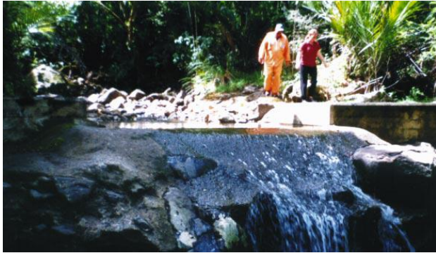
Observing waterflow over a small weir is part of the hydrogeo-logical study of historical water taking rights in the Northland area of New Zealand.

Resource Management Act in 1991 over-ruled this right but allowed for a grace period of ten years for adjustments to be made. Consequently, many existing rights will expire on 1 October 2001. Holders of the old 'Notice of Existing Use of Water' permits will now have to apply for resource consent for the continuation of water extraction.