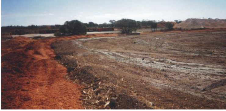
The remediation pad was constructed from heavy clay, won locally from an aquitard horizon found at a depth of between two and approximately six to seven metres.

Over a period of many years, operation of a steel mill at Whyalla, South Australia by OneSteel (formerly a division of BHP Steel), generated quantities of soil contaminated with heavy oil and fuel. Over 4 000 tonnes of this soil has been stockpiled to date.